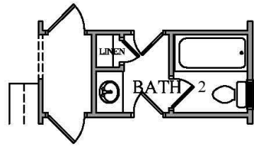
OPT. JACK & JILL BATH